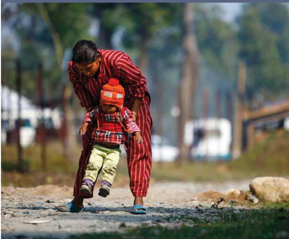
A former Maoist rebel walks with her child inside Shaktikhor Maoist Camp in Chitwan, Nepal. Many female Maoists face significant challenges to reintegrate into their communities, due to the fact that their participation in the conflict required them to break with traditional gender norms

As a complement to these efforts, the government of Nepal is trying to increase women's access to land by lowering the taxation on land registered under the name of a female family member. However, this has not been met with much success as many groups oppose women's land rights based on the fear of losing their traditional farming areas through the transfer of land rights via marriages. Further, in the complex post-conflict political environment, women's rights have also often lost momentum to "more pressing" issues. Despite these challenges however, some of the former female combatants are using the post-conflict social turmoil as an opportunity to act as ambassadors for gender equality in their communities, advocating for a change in repressive gender norms.