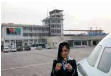
"I am a flight attendant. If I did it, You can do it too"

I am pleased to introduce this special edition of "Afghan Women and the United Nations" and especially pleased to dedicate it to the efforts of girls and women who contribute to a peaceful, developed and prosperous Afghanistan.