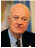
by Staffan de Mistura Special Representative of the United Nations Secretary-General for Afghanistan

The participation of women and girls in today's Afghanistan is more crucial than ever in shaping the nation of tomorrow