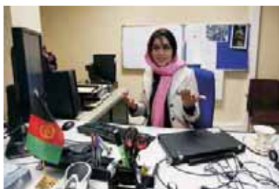
"I am a manager. If I did it, You can do it"