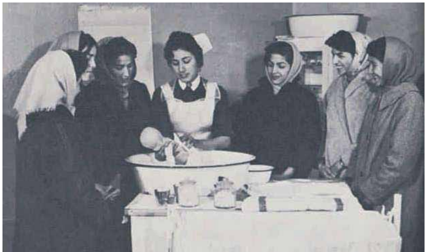
A woman leading a prenatal class in Kabul in the 1960s.