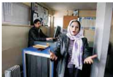
"I am a security officer. If I did it, You can do it"