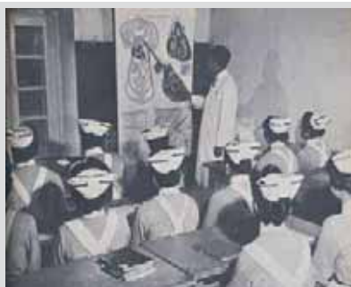
Studying medicine in the 1960s and today