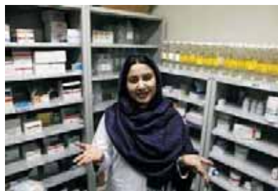
"I am pharmacist, If I did it, You can do it"