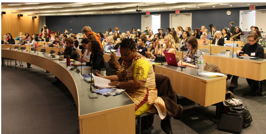
Liberian activist and Nobel Peace Prize winner, Leymah Gbowee and participants at “Implementing the Women, Peace and Security Agenda: A Roadmap for Global Study Recommendation ”

We built on WILPF's 100th anniversary peace summit in April 2015 where we brought together 1,000 activists from 80 countries to mobilise around Women's Power to Stop War. We shared our written statement , calling for “feminist foreign and domestic policy that ensures local action on demilitarisation and women’s human rights for transformative change” as well as for “a change in priorities that invest in women’s human rights, divest from militarism, and safeguard political economies of gender justice and peace rather than economies of inequality and war.”