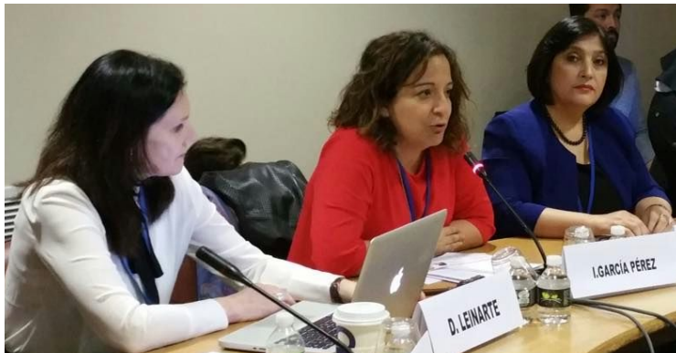
Dalia Leinarte, Iratxe Garcia Perez, Sahiba Gafarova during the event "The Parliamentary Dimension of Combatting Violence Against Women"

On 14 March 2016, the European Parliament in collaboration with the Parliamentary Assembly of Council of Europe held an event entitled "The Parliamentary Dimension of Combating Violence against Women." The panel was composed of Iratxe Garcia Perez (European Parliament); Dalia Leinarte (Vice-Person, CEDAW Committee); and Sahiba Gafarova (Parliamentary Assembly of the Council of Europe.)