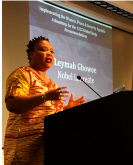
Leymah Gbowee at the symposium "Implementing the Women, Peace and Security Agenda: A Roadmap for the 1325 Global Study Recommendations"

In the opening discussion, Coomaraswamy reflected on her take-aways from drafting the 2015 UNSCR 1325 Global Study. She suggested that the main priority should be to prevent excessive militarisation that has been recently promoted not only by the Member States but also by the UN and other international organisations. Coomaraswamy also reminded participants about the dangers of the use of chemical weapons, the increased development of technologies, and the progress in intelligence gathering that need to be brought to the attention of the international community in order to ensure progress toward the full implementation of the UNSCR 1325. She also emphasized the importance of inclusive processes and the need to mainstream a "conversation" among involved stakeholders with a view to identify problems and take action on them. These conversations, the author pointed out, are a critical prerequisite for action.