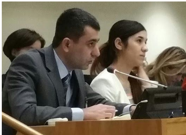
Nadia Murad Basee Taha and her translator during the event “Refugees and Displaced People, Victims of Terrorist Groups: Women and Girls Exposed to a Continuum of Sexual Violence and Exploitation”

“What happens to us is genocide. For three months I have been delivering this message, but international community is irresponsible”, Basee Taha lamented.