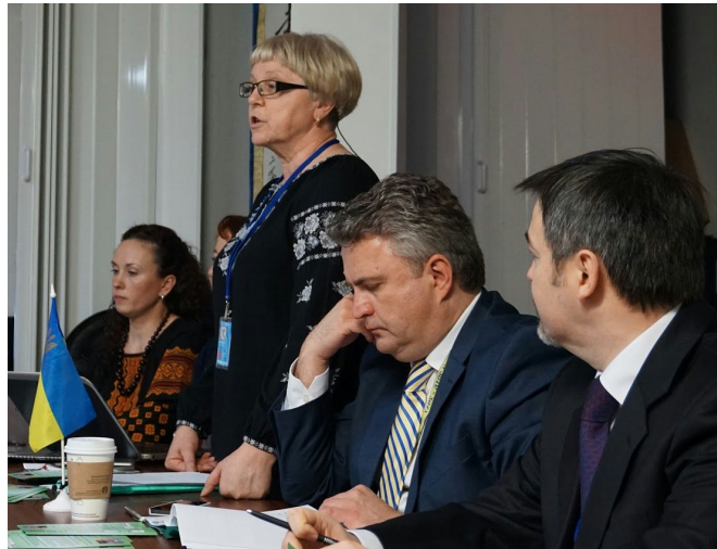
Panelists during the event "Women, Peace and Security and Sustainable Development"

According to Rudenko, "Ukrainian women are more active in defending their own rights than men." Nonetheless, as suggested by Nechyporenko, Ukrainian military forces still support gender stereotypes and implicitly link masculinity with militarism. Under order of the Ministry of Defense, women cannot serve in all types of military operations and when they do join the military, they face a lack of social protection and mental and physical support.