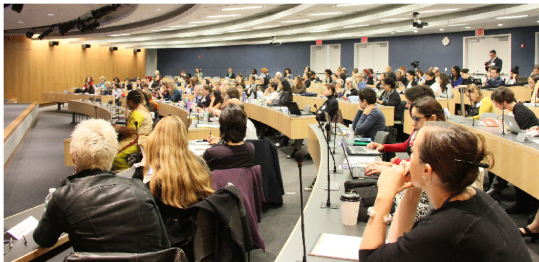
The audience at the symposium "Implementing the Women, Peace and Security Agenda: A Roadmap for the 1325 Global Study Recommendations"

MenEngage Alliance, NGO Working Group on Women; Peace and Security; and Nobel Women's Initiative; hosted a symposium with the theme, "Implementing the Women; Peace and Security Agenda: A Roadmap for the 1325 Global Study Recommendations."