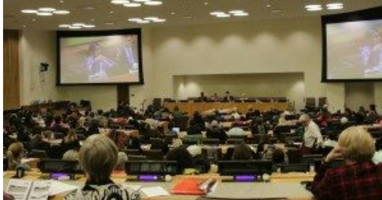
Attendees at “Women Peacekeeping Teams Use Unarmed Civilian Protection (UCP) Methods of South Sudan”

Throughout the talk, speakers working at the local level to implement NP strategies explained the method’s four-pronged approach: Proactive engagement and protection; conflict monitoring; relationship-building among all parties; and local capacity development.