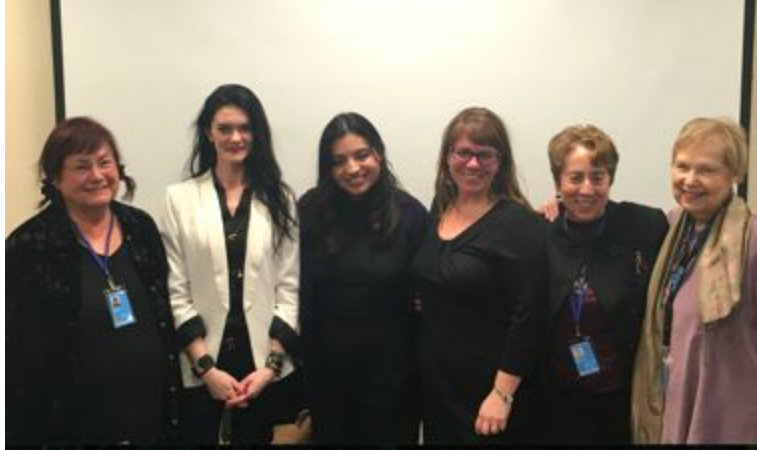
Just a few of the 100+ women in attendance at "From the Global to the Local: CEDAW Activism in the United States"

The panel discussion brought together passionate speakers representing city and state-based CEDAW Coalition representatives from Los Angeles, Louisville, Cincinnati, and Oregon. Throughout the talk, topics ranged from methods of ending discrimination against women in the workplace, to ending violence against women in the private sphere, working with local government to develop and understanding of CEDAW and support political action, and acknowledging the importance of utilising an inclusive, gender-sensitive lens when developing and strengthen governmental initiatives and policy.