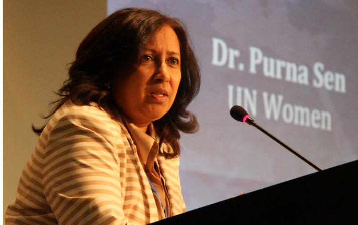
Dr. Purna Sen during "Implementing the Women, Peace and Security Agenda: A Roadmap for the 1325 Global Study Recommendations"

After the panel discussion, participants broke out into conversation circles on five priority issue areas to discuss strategies for creating change, outline civil society commitments, and share calls to action. Issue areas included: 1) addressing militarisation and violent masculinities, 2) preventing violent extremism, 3) supporting women's human rights defenders and peacebuilders, 4) adequate financing for the WPS agenda, and 5) participation in peace and reconstruction Processes.