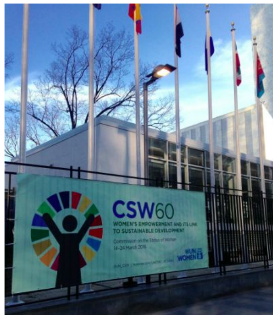
A CSW60 banner outside UN headquarters in New York