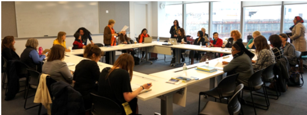
Example of conversation circle during "Implementing the Women, Peace and Security Agenda: A Roadmap for the 1325 Global Study Recommendations"

After the panel discussion, participants broke out into conversation circles on five priority issue areas to discuss strategies for creating change, outline civil society commitments, and share calls to action. Issue areas included: 1) addressing militarisation and violent masculinities, 2) preventing violent extremism, 3) supporting women's human rights defenders and peacebuilders, 4) adequate financing for the WPS agenda, and 5) participation in peace and reconstruction Processes.