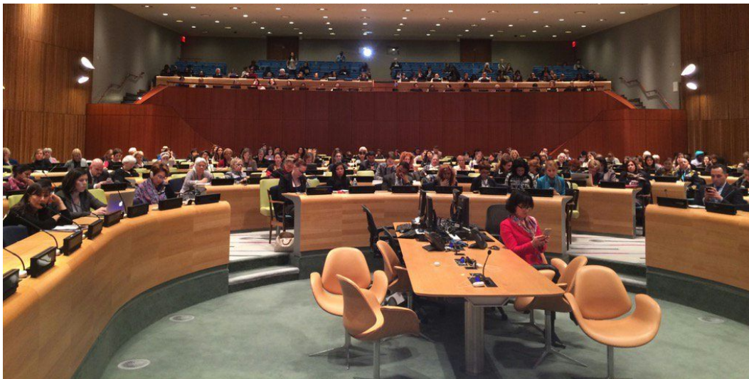
Inside the side event at UN Headquarters in New York