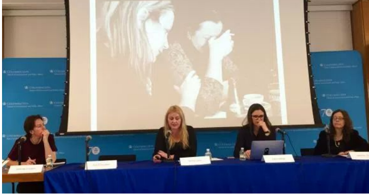
Panelists at “Global Sexual Violence during Conflict: from the Balkans to Africa to the Middle East”