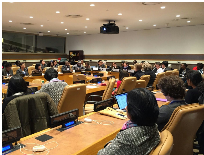
Attendees at “Show Me the Money: How Governments Allocate and Audit Funds to Achieve Gender Equality as a 2030 Sustainable Development Goal”

emphasised the importance of financial and operational audits to ensure the effective implementation of the agenda, and to optimise the use of funds allocated to specific programs. They both demonstrated how a top-down approach could help empower beneficiaries.