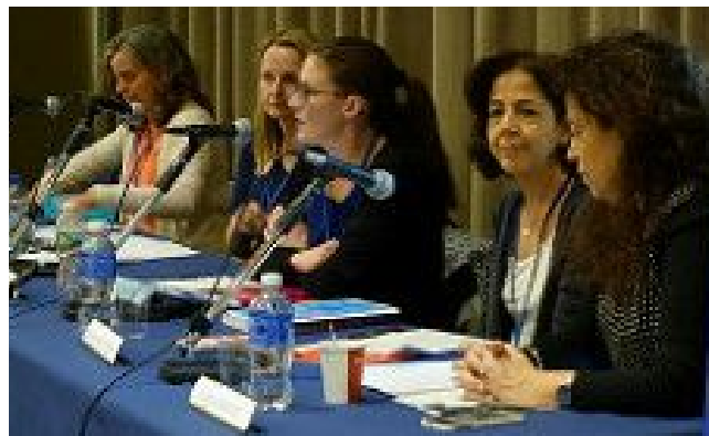
Panelists at "Gender and the SDGs: the Outcome, the Processes, and the Prospects"

During this event, the panel contextualised and assessed the SDGs and the MDGs. Paying particular attention to the dedicated SDGs on gender equality (Goal 5) and peaceful societies (Goal 16), this event provided an opportunity to critically analyse the diverse tools available, at both national and international levels, to achieve gender equality and peace. It also provided a platform to briefly address the broader political economy of exploitation and violence, as participants also questioned assumptions underlying growth-based economic models and the role of financial institutions in the achievement of the agenda.