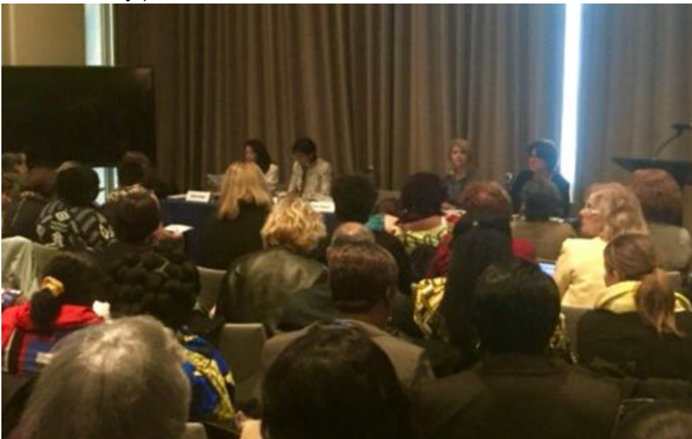
Panelists at “Addressing Violence Against Women and Girls to Achieve Sustainable Development”